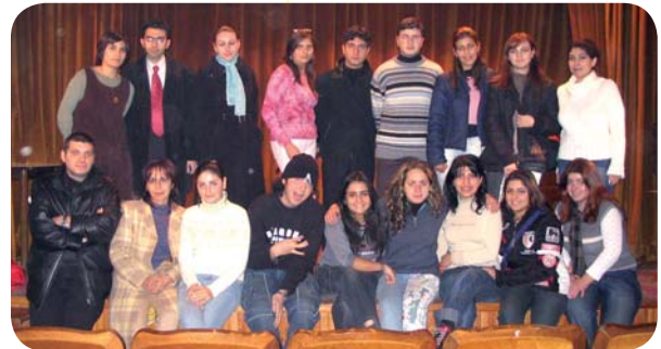
Legal training organised by LAC