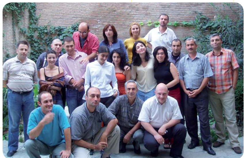
Founding Members of IFA-SC